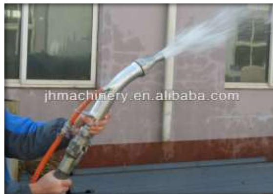
Fig. – Water Pressure Test

Water is forcibly applied in Polymer Plaster and the adhesiveness of Plaster should be checked. If the upper part is roved then the adhesiveness has been reduced, if not then it is ok.